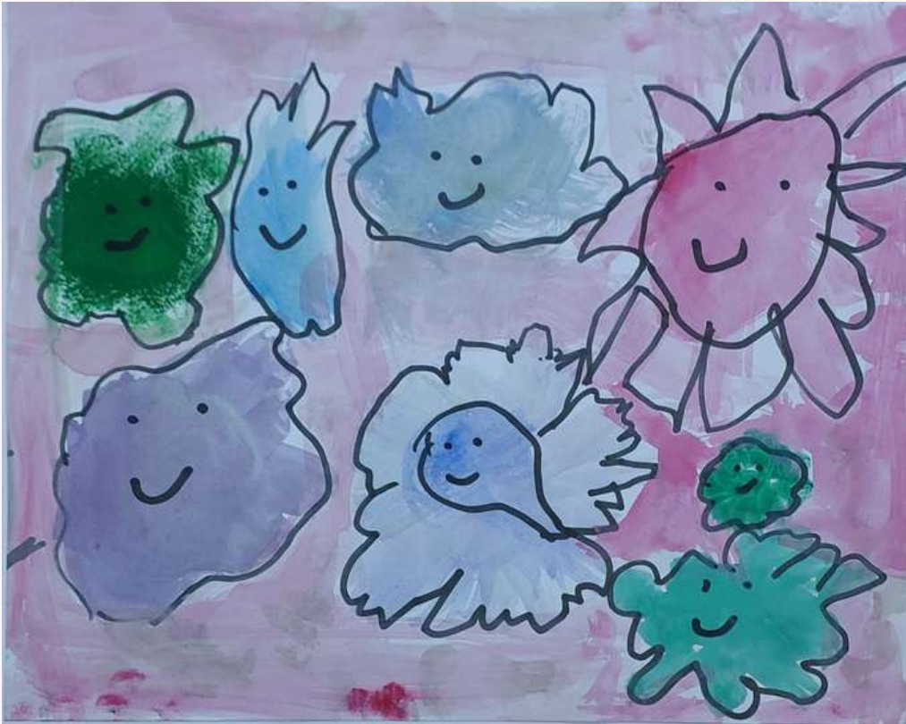
By - Siyara Hurla Acacia