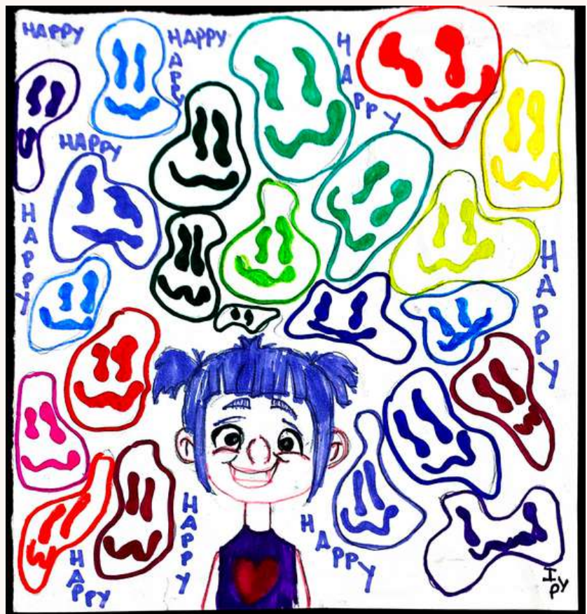
By - Ian Phuntsog Eustoma